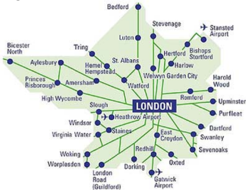
Diagram 1 – London TravelWatch Remit

This consultation draft paper sets out our how we think train services on the Chiltern route into Marylebone should be developed, both in the short term and looking ahead to the 2020s.